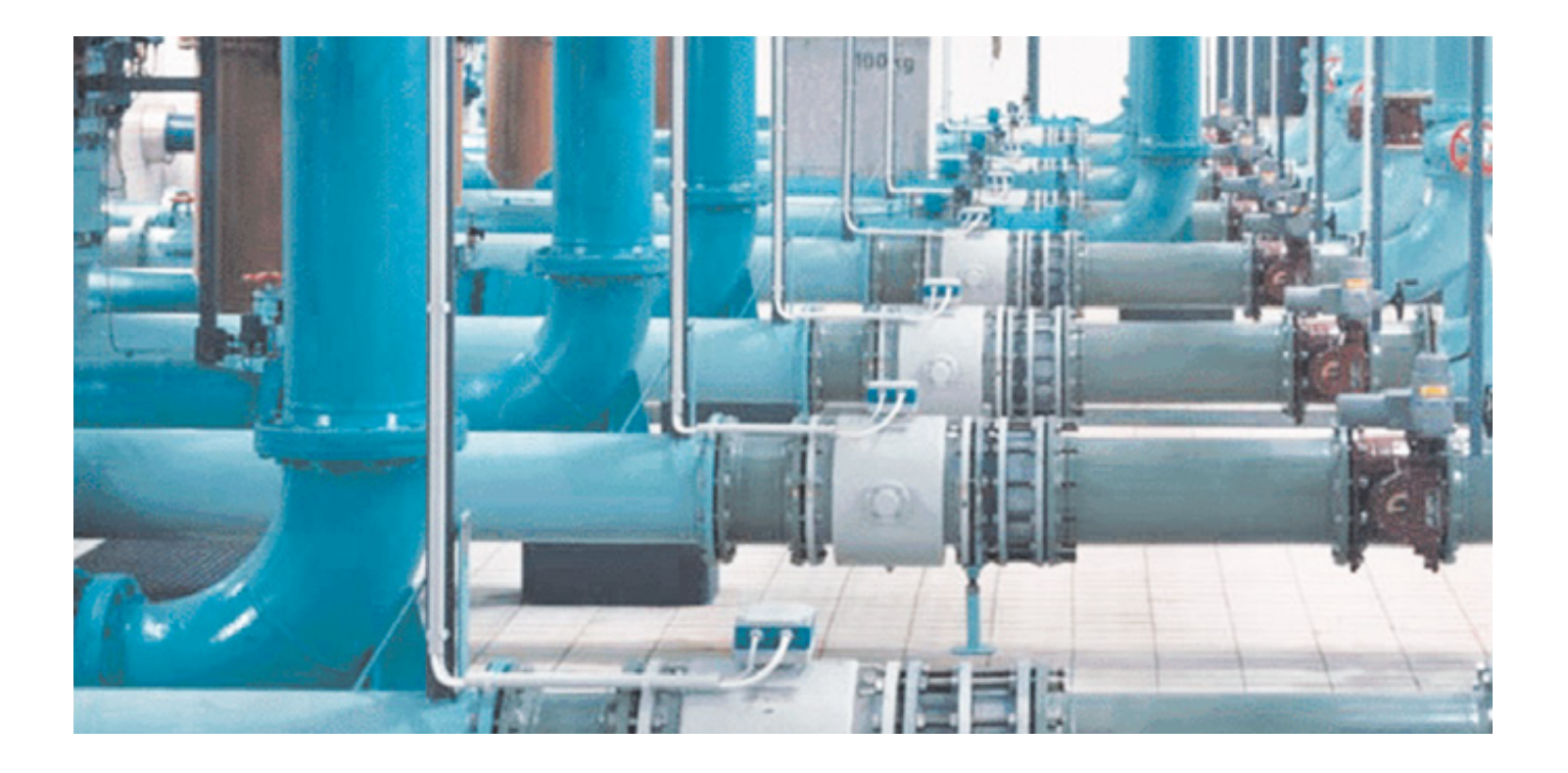
ABB Instrumentation Calibration Services

The greatest value from your capital investments can only be achieved if optimal measurement performance of field devices is maintained.