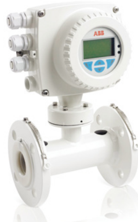
ABB has developed a unique in situ verification tool—CalMaster<sup>TM</sup> to enable these tests to be carried out without having to remove the flowmeter.